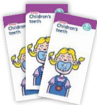
Children's teeth leaflet