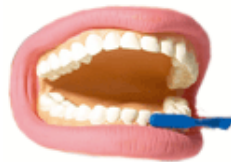
Giant teeth dental model