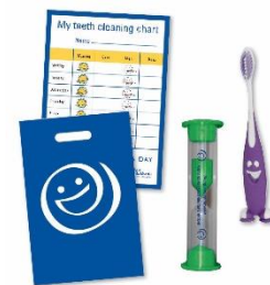
Dental goody bag