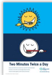
Two minutes poster