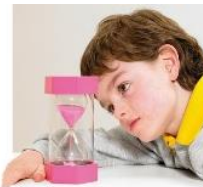
Large sand timer