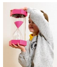
Huge Sand Timer