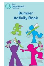
Bumper Activity Book