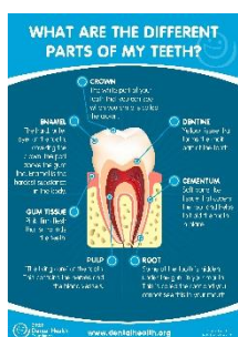
Anatomy of a Tooth poster

Specifically to deliver the lesson outlined above the following resources are particularly relevant: