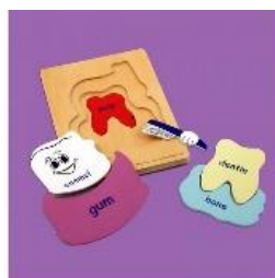
Wooden Tooth Puzzle