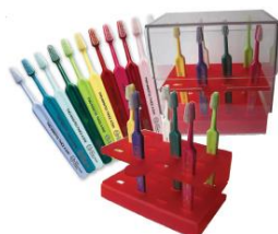
BrushBox and brushes