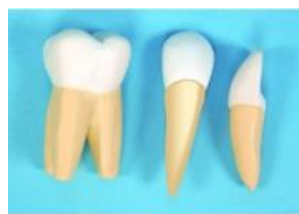
Models in individual teeth